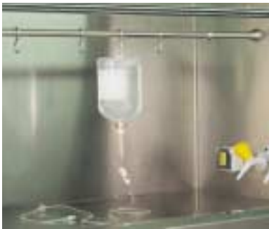
300458 Rod with 6 support hooks