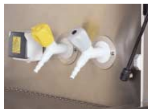
Standard delivery includes U.V. lamp, electrical socket and two stop-cocks