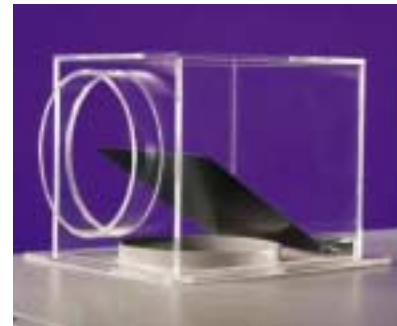
300230 Anti blow-back valve