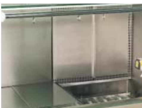
Working table sectioned allows easy cleaning and manipulation