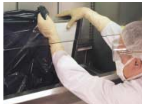
Filter cartridges guarantee safe and easy filter replacement

Stove-enamel coated steel cabinet. Easy access for working and cleaning. Working space in stainless steel AISI 304. Segmented working surface. Laminated safety front window with gas springs. Three HEPA filter stages H 14 efficiency 99,999% for particles >0,3 µm easily accessible for replacement.