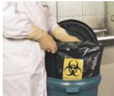
Hermetic vessels to dispose of filters