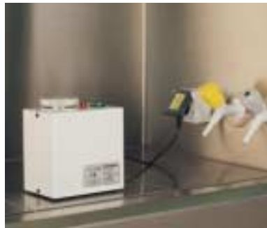
326681 Formalin vapouriser