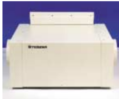
300188 Activated charcoal filter